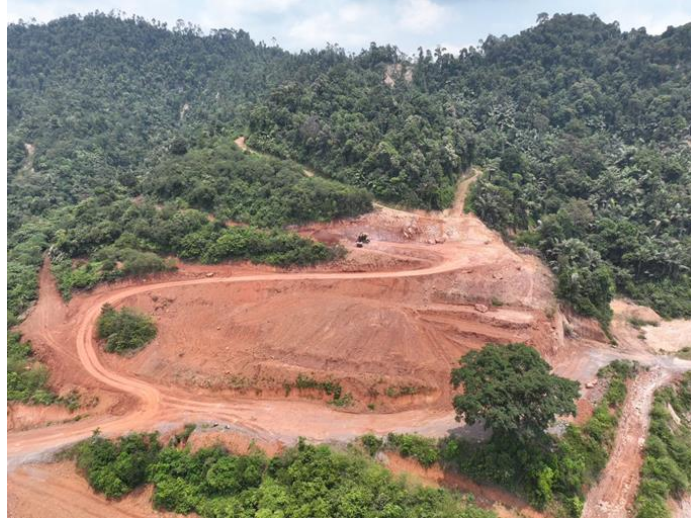
Figure 1: Western Spur

Ever since the Group has adopted the underground mining technique, our geologists are able to visually confirm the shape of the orebody and compare them to the mineral resource block model. The visibility of the actual orebody is valuable to our understanding of the mineralisation, the accuracy of the block model as well as serve as input to our future exploration program. During 1Q FY2024, our geologists have carried out sampling on the wall of the tunnels and adits that are outside of the block model as well as surveying their sizes in order to update and reflect the actual mineralisation, and thus reporting an update mineral resource, which is paramount to the reporting of Chaah mine ore reserve.