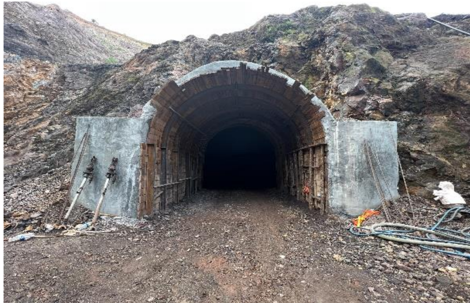
Figure 5: Tunnel portal wall constructed at the entrance of -87mRL.

The development stage for southern region at Chaah Mine commenced on 28th September 2023. For development stage, there are currently three (3) interval levels of tunnel designed at southern part of the pit which are separated at 25m intervals between each level. The tunnels which are planned and designed are at level -87mRL, -112mRL and -137mRL. During the development stage, the access paths which consists of Main Tunnels and Adits are constructed inside each level inside wireframe ore body digitized during exploration period at each respective level. Concurrent with the path being constructed, the iron ore blasted or obtained is extracted and can be sent to the processing plant. Due to tough geological conditions of the southern pit region, safety aspects must be considered before proceeding developing the tunnel. Thus, tunnel portal wall had been constructed in this early stage. As the geological condition consists of fractured ores near the entrance of tunnel portal, shotcreting works is also conducted to ensure the tunnel path is secure and safe.