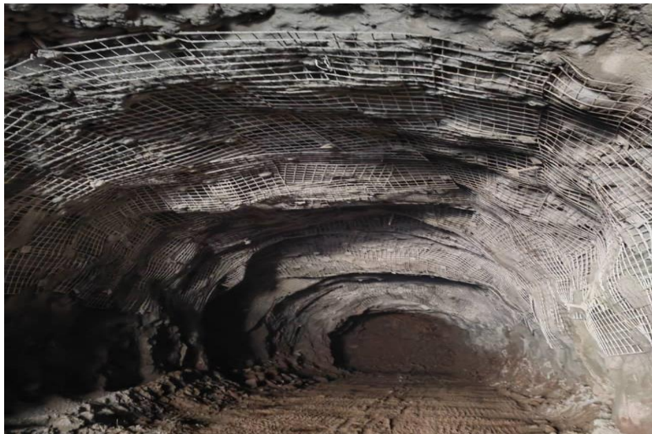
Figure 6: Shotcreting works and wiremesh installed at the entrance of -87mRL.